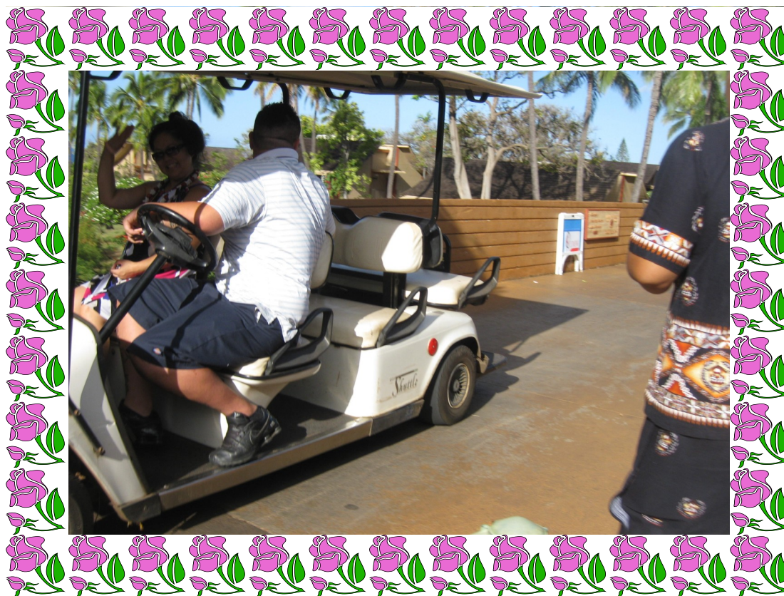
A chance to use some of the Hawaiian hospitality